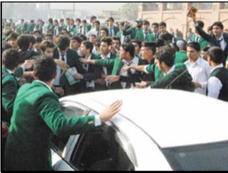
Students of Edwardes College in protest

So the plight of Edwardes College in Peshawar is a concern for Christian institutions not only in Muslim-majority countries but in any context where Christians are a minority and where religious extremism of any kind—Hindu, Buddhist, Muslim or whatever—may be