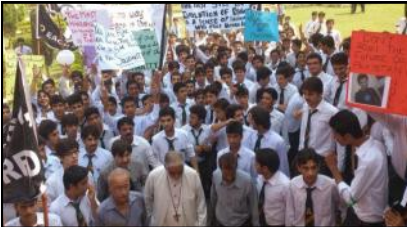
Interfaith peace rally at Edwardes College following the September 2013 bombing of All Saints’ Church, Peshawar

head of the “sponsoring body,” in this case the church, must be the chancellor and that the sponsoring body must have a majority on the governing board. Opposition erupted both from a few Muslim faculty members who had long sought public-sector status, and from the province’s higher education officials, who wanted the government, not the church, to have ultimate control over this flagship institution. Opponents questioned the federal model charter’s applicability to the province, asserted that the Church of Pakistan did not really own the property, claimed that the 1974 notification meant that the church was not the sponsoring body, and even attacked the integrity of the bishop and the diocese. Lacking a legal foundation, they then moved to threats and violence.